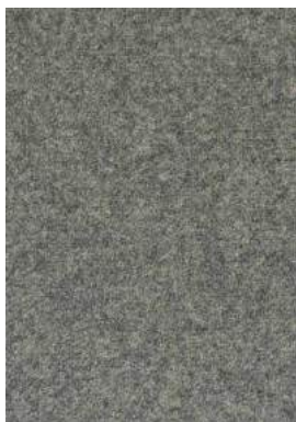
Light grey (FR1000)